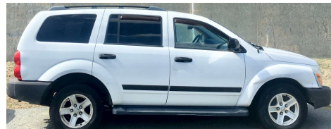
2006 Dodge Durango 4 x 4

AUCTIONEER'S NOTE: A large sale with many items from lost & found to retired City of Rehoboth items, plus bicycles, jewelry, phones, office equipment, tools, Cars, Trucks and more!! Must be seen to be appreciated, so come ready to buy at Auction Prices!! Auction is being held on site, rain or shine!!