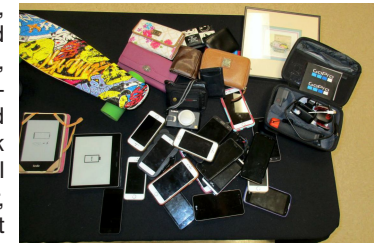
Sev. dozens bikes