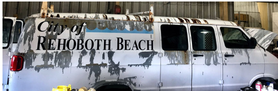
2002 Dodge Maxi Van