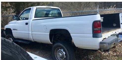
2002 Dodge pickup w/dump bed