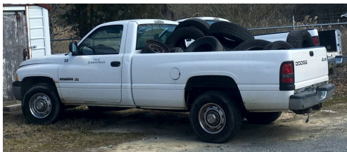
2001 Dodge Ram pickup