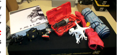
Tools & electronics