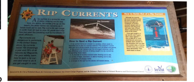
10 historical beach info signs