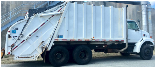
2003 Sterling Leach trash truck