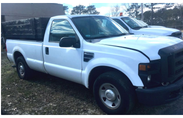
2008 Ford F-250 with slide in dump body