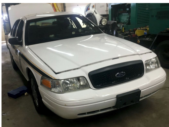
2010 Ford Crown Vic