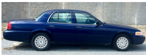
2004 Ford Crown Vic