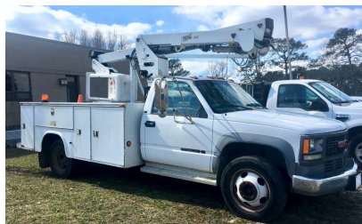
2000 GMC bucket truck