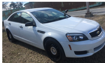
2014 Chevy Caprice