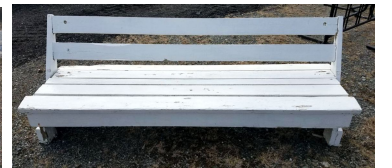
Approx 45 boardwalk benches