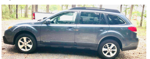
2014 Subaru Outback loaded w/leather, moonroof, and backup camera. 78,000 orig miles