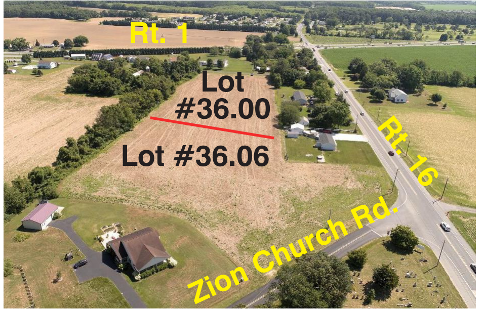
Looking North and East from Rt. 16 at the Intersection of Zion Church Road