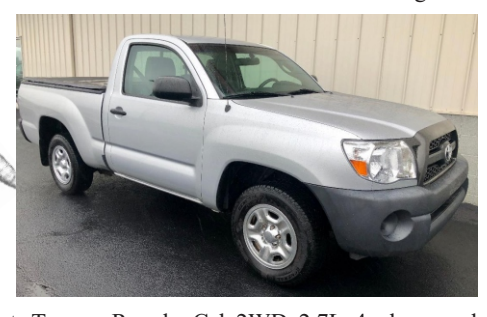
2011 Toyota Tacoma Regular Cab 2WD. 2.7L 4cyl, manual 5 speed, 138,598± miles, ONE OWNER CLEAN CARFAX, DE and MD State Inspected.