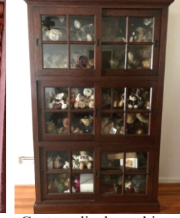
Custom display cabinet