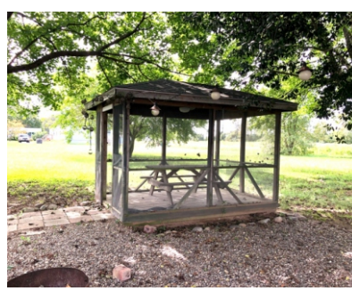
Custom screened gazebo w/electric

ARTWORK, CHINA, COLLECTIBLES, GLASSWARE, RUGS, TOYS OUTDOORS & MORE: 16' Mackinaw Sundolphin canoe, pr. lg. ginger jar lamps, 26" Toshiba flat screen TV, set decorative starfish, fish platter, hanging contemporary shelves, sm. chrome Metro shelf, lot countertop appliances, lot bar fixtures and barware, full contents of kitchen incl. pots, pans, dishes, etc., contemporary wall clock, ogee mirror, fireplace tools, computer components, outdoor gas BBQ grill, misc. lot ladders, garden tools, fishing tackle, shelving, racks, hammocks, hoses, saw horses, tools, etc., window unit AC, outdoor games, framed photo of all types & sizes of knives, prints & photos and much, much, more!!!