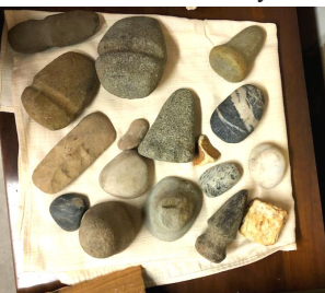
Lg. lot arrowheads, tomahawk heads & more