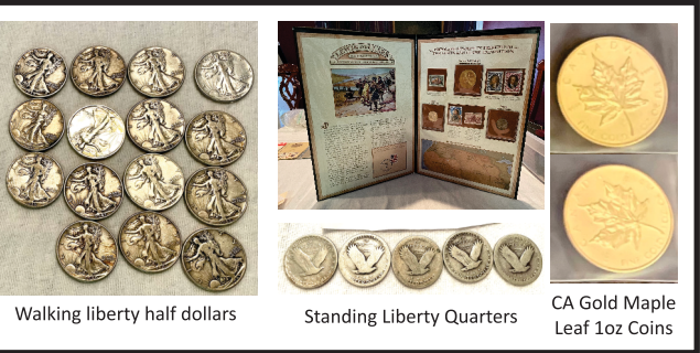
Walking liberty half dollars

TERMS REAL ESTATE: A 10% deposit in cash or personal check with 2 I.D.'s on day of sale with the balance due and payable in 30 days when good unencumbered marketable title will be delivered. A 3% Buyer's Premium to be added to the final accepted hammer price and collected at closing. Seller has the right to accept or reject the final bid on Real Estate, however, they are very motivated and it is there intent to sell on Auction Day!! Property sold As Is, Where Is. TERMS CONTENTS: Cash, personal check or credit card with 2 I.D.'s on day of sale. A 13% Buyer's Premium will be added to all purchases, w/a 3% discount for payment by cash or check. All items sold "As Is" with removal day of sale. AUCTIONEER'S NOTE: A 1 story home with 2 car garage and Florida room, on a super corner lot. Home is approx. 1 mile from the town of Milton yet a short drive to Lewes and Rehoboth Beaches. The home is in need of remodeling but can be a good value. Nice guns, coins and very low millage vehicles. Come early and bring a lawn chair. Sale held rain or shine!