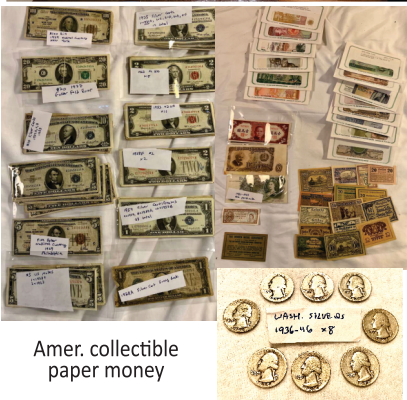
Amer. collectible paper money