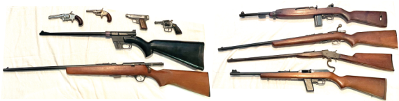
See Gun List