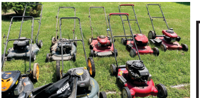
Troy-bilt & Craftsman Push Lawn Mowers