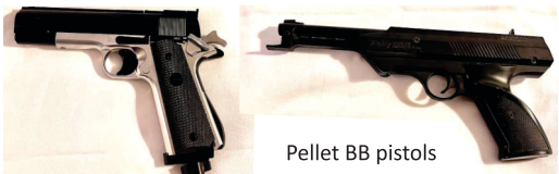
Pellet BB pistols