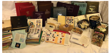
Extensive Stamp Collection