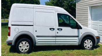
2012 Ford Transit Connect Van Advance Trac 6k orig miles