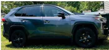
2020 Toyota Rav 4 XSE Hybrid 4WD loaded, 25k orig miles

202 E. GEMINI LANE "CAVE COLONY" MILTON, DE