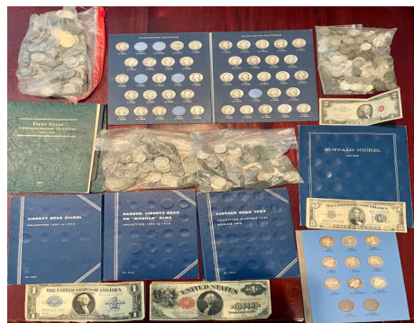
Lg. coin collection