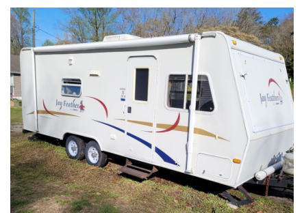
2004 Jayco 23B Jay Feather w/ equalizer hitch, new wheels, tires and water heater. Working micro., refrig., furnace, A/C and range