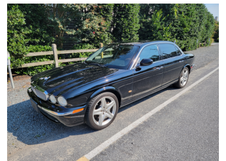
Black with black leather, only 85k miles, garage kept